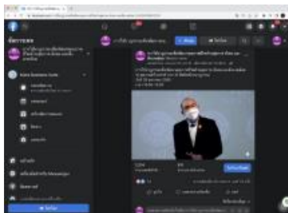
Figure 3: Page image showing the number of visitors to the Facebook page on the use of drama to develop quality of life in terms of health, society, and the environment. Source: Facebook page on the use of drama to develop quality of life in terms of health, society, and the environment.