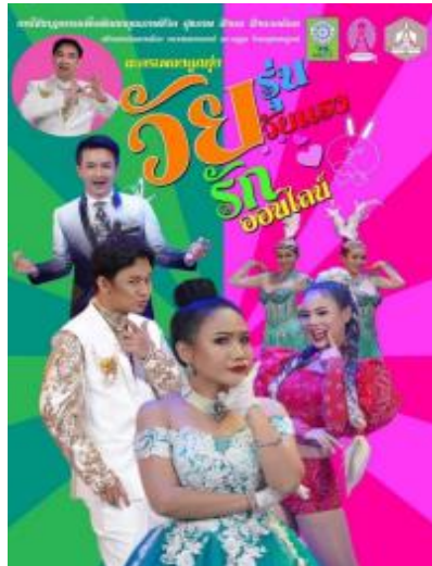
Poster image of the Country musical script, Love Online

sing clearly, having time for practice, memorizing lines, and understanding character traits. Performance rehearsals during COVID-19 use online media channels to rehearse lines, read lines, and communicate and understand each other. It is a new dimension in performance management.