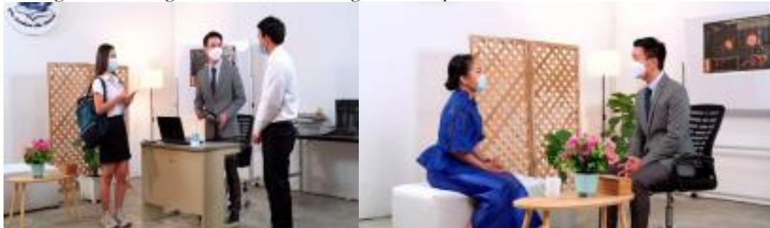
Teacher's room scene