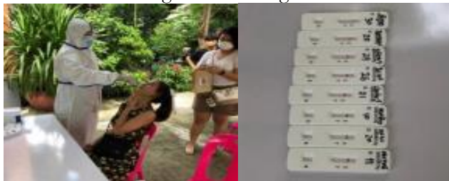
ATK Testing before Rehearsal

Each part has different duties. And with the situation of the COVID-19 epidemic, it is very important to limit people and control the number of people working. In the rehearsal of the show, the meeting of the actors is reduced by using the method of rehearsing the script through the ZOOM system, setting up a LINE group and distributing the script to the actors, explaining the characters so that the actors can memorize the script before the rehearsal day. By using the method of rehearsing the script through the ZOOM program for 2 days. When the rehearsal is complete, the actors must practice singing each person to meet on the dress rehearsal day before the actual filming day. There is an explanation schedule. In the rehearsal, there must be an ATK test according to disease control regulations. Even though the staff and actors have been tested with ATK, everyone must wear a mask. Throughout the training, the researcher has arranged the training to be within disease control measures.