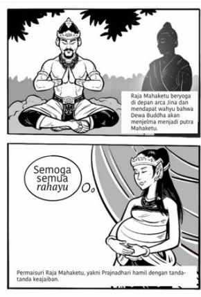
Figure 4. Dark and light sketches.