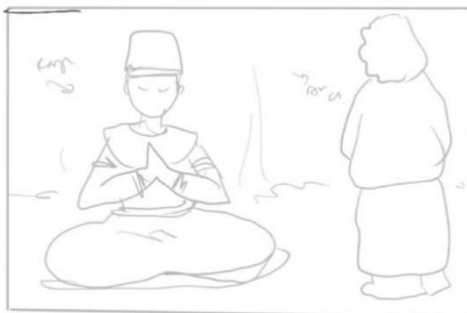
Figure 2. Basic sketches of Maharaja Mahaketu and the Buddha statue.

Drawing or visual illustration of characters is done using the procreate application (McCready, 2021). Procreate is one of the popular illustration applications among professional illustrators, and it has various features to support the creation of illustrative images. Initial sketches or basic sketches are made to compile various initial illustrations to make it easier for comic artists to determine the composition of images and storylines. This sketch is made by utilizing the studio pen 1 size 12 ink tool on the iPad Air, as shown in the following example image.