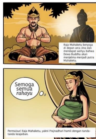
Figure 5. Color sketches.

This coloring aims to provide visual aesthetics to the reader (Gumelar, 2011) and increase reader appeal. Similarly, coloring also serves to further reveal the spatial dimension. In comic drawing techniques (Iskandar et al., 2022), color also plays a role in strengthening the character so that readers can get to know the character more quickly by looking at the color identity, as shown in the following image.