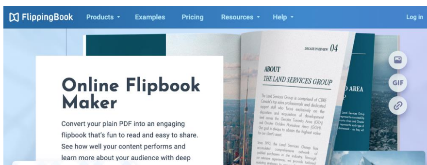
Figure 6. FlippingBook application view.

The Digital Comic of Prince Sutasoma can be opened and read by importing files on the Books application on iOS-based devices and Google Playbook on Android-based devices. Digital books are created by utilizing the FlippingBook application, a simple application that displays books in PDF format in flipbooks.