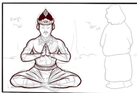
Figure 3. Fine sketch of Maharaja Mahaketu's figure and Buddha statue.

Fine sketches are made to determine the character of the character in the story. In addition to facial characteristics, the fine sketch also determines the depiction of characters with their clothing characteristics. The tool used is a Tool pen size 13 with 100% thickness. Fine sketches in the process of making the Digital Comic of Prince Sutasoma can be seen in the following example image.