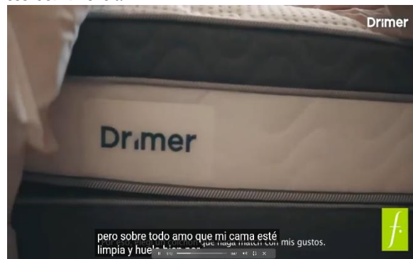
Figure 01: Drimer mattress advertisement by Saga Falabella, where the use of racial stereotypes in the representation of characters is evident.

Therefore, the relevance of this topic lies in the importance of promoting fair and inclusive representation in advertising, especially in a multicultural society like ours. Advertising not only reflects but also shapes public perceptions and attitudes toward different ethnic groups. The concepts studied provide an essential framework for understanding and critiquing these practices, highlighting the need for an ethical approach in the creation of media content. In the following link https://youtu.be/J-6ISA_8stk?si=ip9hk-PTRJpULbDH , we reflect on the absence of an engineering-based approach in the construction of discriminatory stereotypes toward racialized women: a case study of the Drimer mattress commercial.