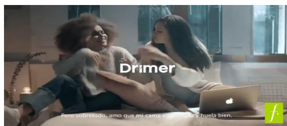
Figure 4: Drimer mattress advertisement by Saga Falabella, where the use of racial stereotypes in the representation of characters is evident.