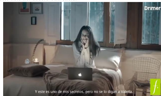
Figure 3: Drimer mattress advertisement by Saga Falabella, where the use of racial stereotypes in the representation of characters is evident.

Note: The character states that his mattress does not absorb bad odors.