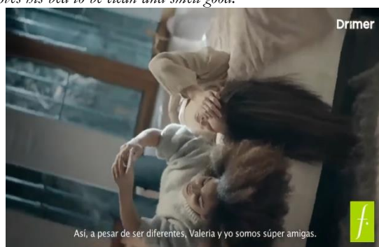
Figure 5: Drimer mattress advertisement by Saga Falabella, where the use of racial stereotypes in the representation of characters is evident.

Note: The character emphasizes that he loves his bed to be clean and smell good.