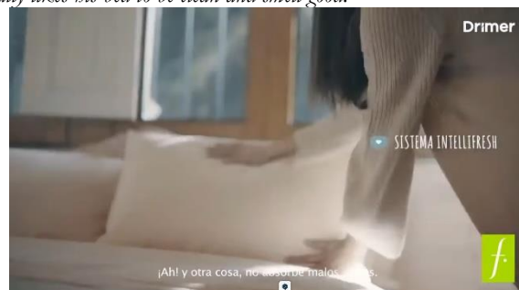
Figure 2: Drimer mattress advertisement by Saga Falabella, where the use of racial stereotypes in the representation of characters is evident.

Note: The character narrates that he really likes his bed to be clean and smell good.