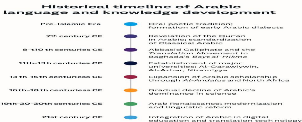
Figure 1. Historical Timeline of Arabic Language and Knowledge Development.